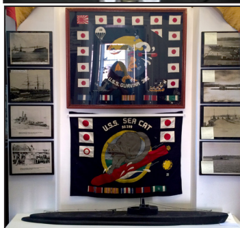
SECONN {PH 2 O} EXHIBIT

SECONN Skin Divers was founded in 1963 to promote safety and education in diving. This Fall SECONN present a photography exhibition to highlight the marine and freshwater environments of New England at the Custom House Maritime Museum. Whether you view it from under the water or from above, there is no denying the natural beauty of New England's coastline! Opening Friday, November 11.