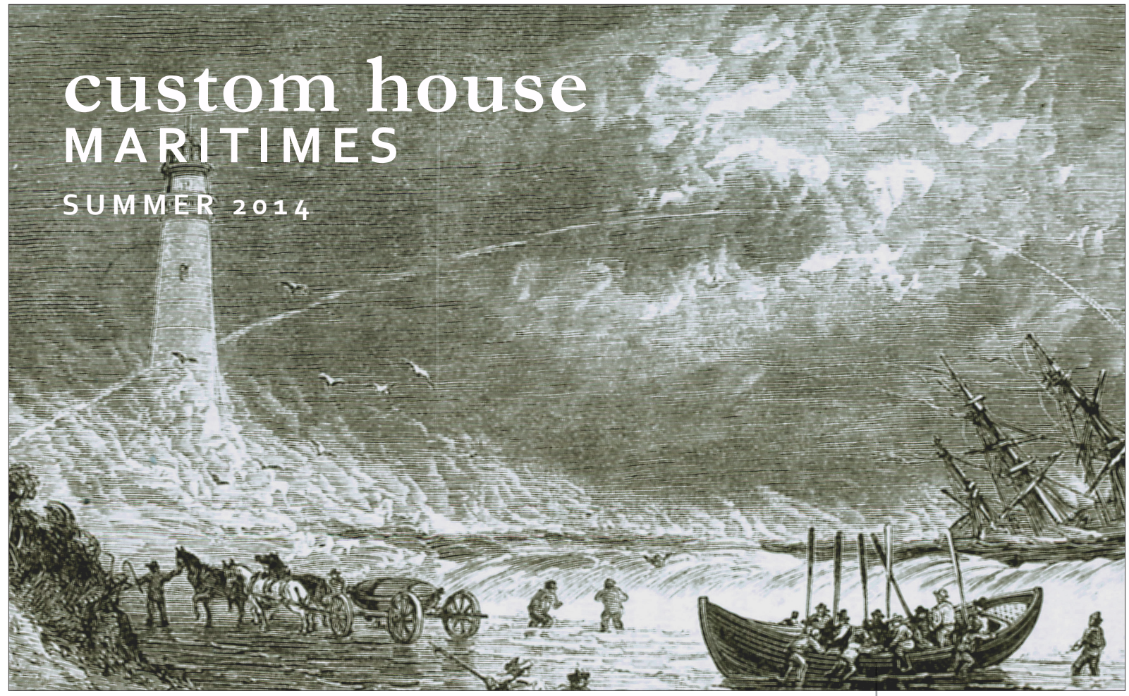
Above: Detail 'Launching the Life- Boat," by Granville Perkins. Wood-cut engraving, illustration from Our Young Folks, April 1869.