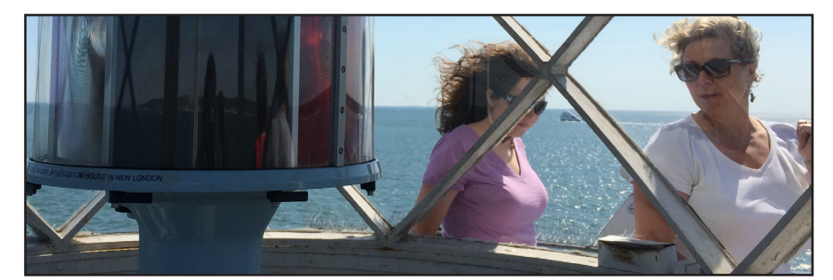
Our trips to Ledge Lighthouse leave from New London's City Pier everyother-Saturday. The 2 1/2-hour excursion includes one hour on Ledge Light, where you can view exhibitions and climb up into the lighthouse lantern.