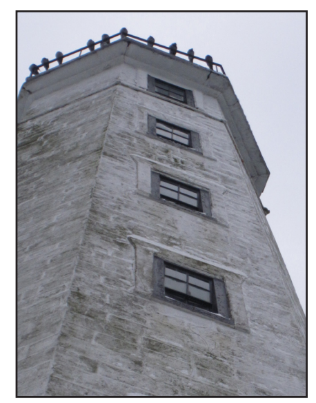
It will cost about $100,000 to scaffold, tent, scrape, and repaint the lighthouse. We also have damage from Superstorm Sandy to fix, including the walkway and sea walls. Over time, we also hope to rebuild the dock. Watch for our fund-raisers or donate at nlmaritimesociety.org.

Folks, let me tell you: getting older is a state of body; getting "old" is a state of mind, and a choice. Get involved, in our efforts at your community Museum and in anything that interests you. And stay involved.