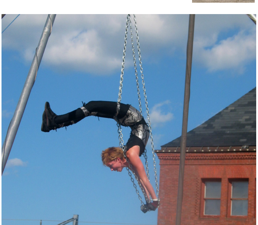
Nimble Arts Circus returns with two free performances and a juggling workshop on July 14 as part of Sentinels on the Sound: New London Lighthouse Weekend / Don't Miss the Boat.