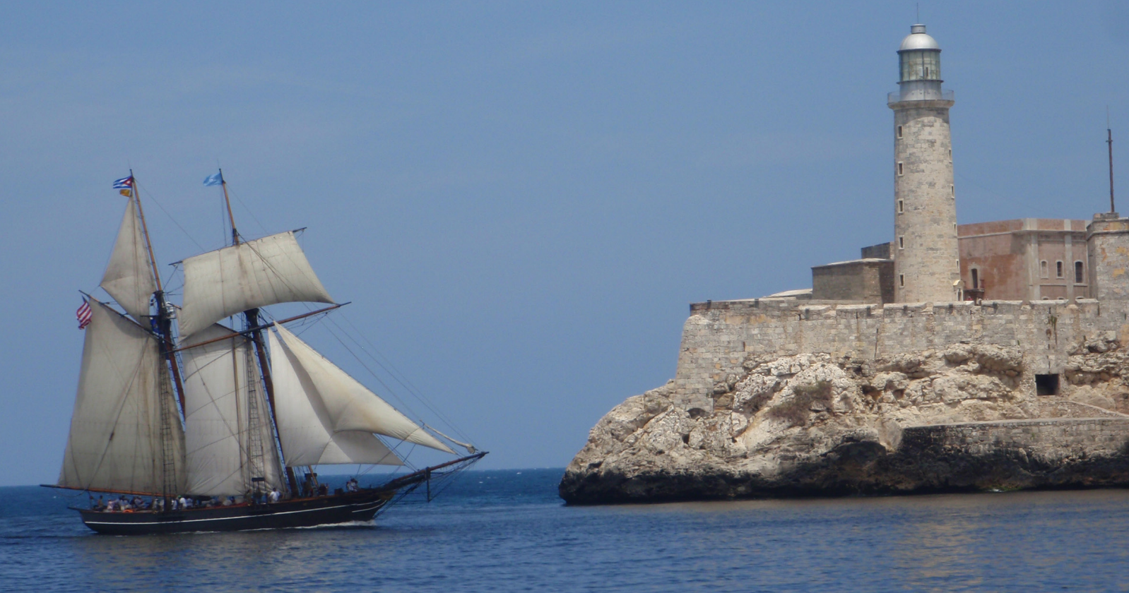
The Amistad entering Havana on March 26, 2010.