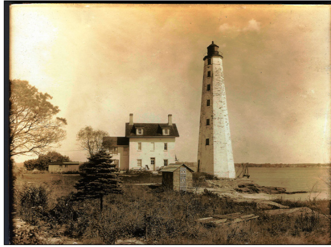
Photograph, circa 1935. The photo was taken after the lighthouse was automated and the keeper's house sold to a private party. It can be dated by the fact that the connection between the keeper's house and the lighthouse has been removed.

In 1855, a fourth-order Fresnel lens to illuminate 315 degrees was installed; it remains in use to this day. New dwellings for keepers were provided in 1863 when the tower's cast iron circular stair and lantern were added. Its