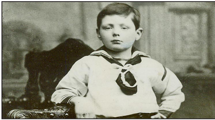
Kids Ahoy! Our new childrens' exhibition opens this fall. That young sailor, above , is Winston Churchill.