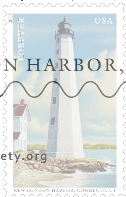
2013 stamp of New London Harbor Light