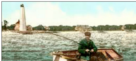
New London Harbor Light

This picture, showing the state of the foundation on September 5, 1874, is from a Sketch by Mr. F. Hopkinson Smith, the constructing engineer.