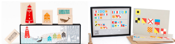
NEW in the Museum Shop! - Stamp sets, ink pads & note cards.