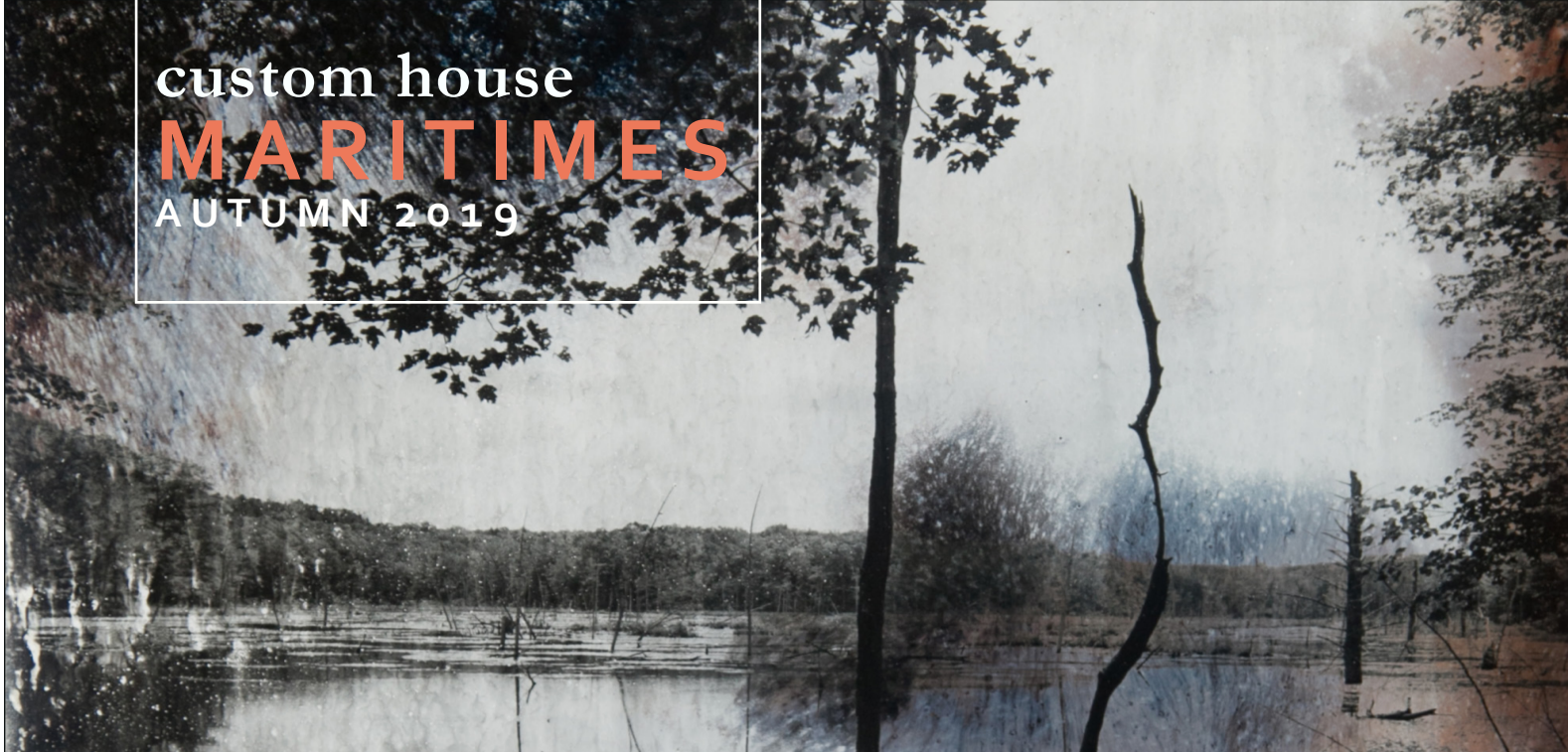
Tree in Salt Marsh #1 (detail), 2015, photographic monoprint, Denny Moers