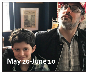
May 20-June 10