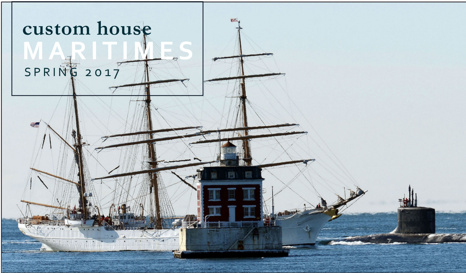
Friday, April 21, 5:30 PM is the Opening for Lighthouses, Tall Ships, and Submarines: Maritime Photos from The Day's Photojournalists. Above, The United States Coast Guard Barque Eagle motors past New London Ledge Light as the U.S. Navy Virginia-class attack submarine USS California (SSN 781) passes southbound Thursday, January 23, 2014. The show will be on view at the Custom House through July 16, 2017.